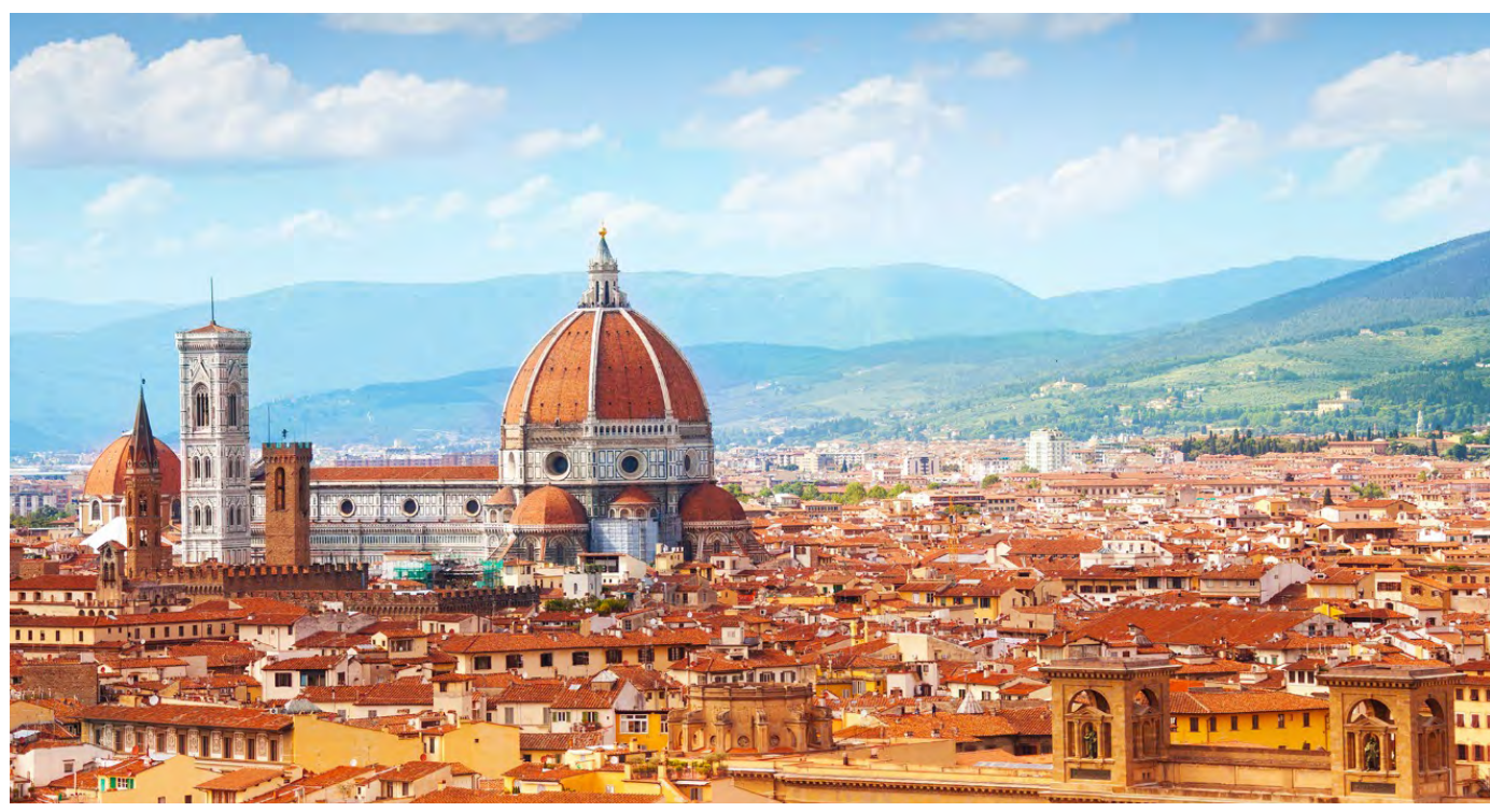
Friday 29 + Saturday 30 September

rrive into the magnificent city of Florence. Following your checkin to the hotel, you can spend the afternoon settling in or exploring the vibrant city. Florence is home to some of the world's most spectacular architecture, museums and art galleries, so there is no shortage of cultural delights to unearth.