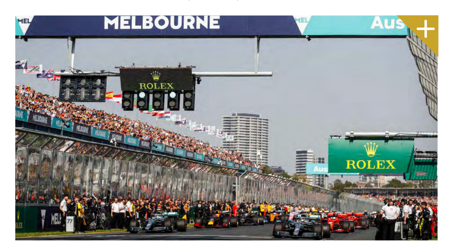
Friday 8 - Sunday 10 March*

ove Formula 1? Then join us in Melbourne at our private corporate suite for one of the first Grand Prix weekends of the season.