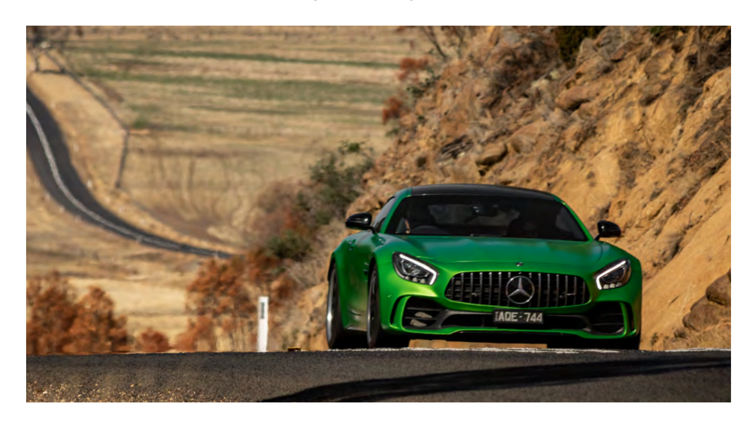
Monday 11 - Saturday 16 March*

Your Tasmanian odyssey begins in Melbourne, where the group will meet at a central starting point, before convoying together to Geelong to take the overnight ferry to Tasmania.