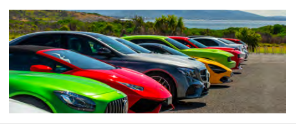
Per Car: POA

Don't live in Victoria? We can arrange the return transfer of your vehicle. Enquire with our team to find out more.