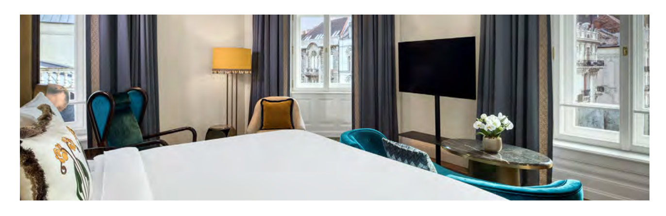
Enquire for pricing

The package includes double or twin-share accommodation in a Deluxe Room at each hotel. Please contact our team for options to upgrade your room category, or to discuss single supplement options.