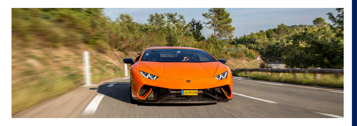
Enquire for pricing

The package includes a gold category supercar. You have the option to upgrade to platinum category supercar on request and subject to availability.