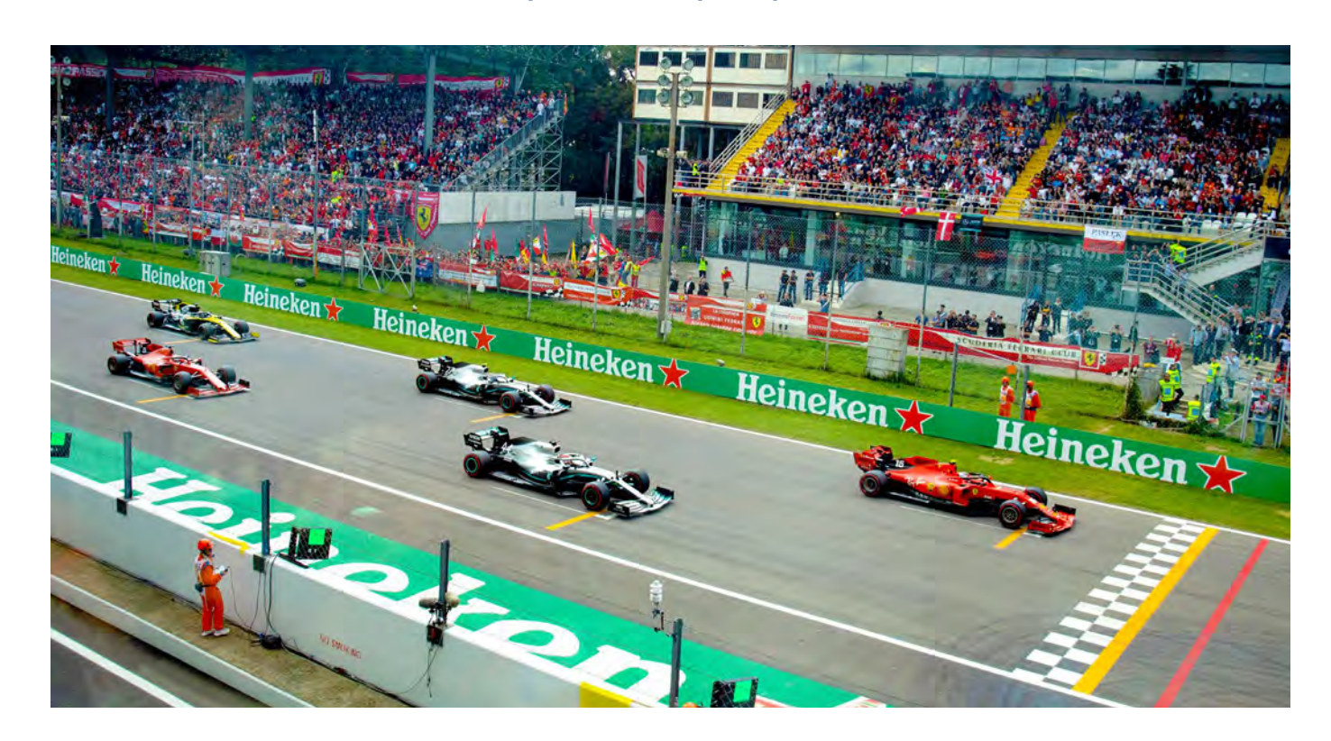
Friday 30 - Monday 2 September

or those wishing to experience one of the most legendary races in the F1 calendar, you can choose to join us for the Italian Grand Prix weekend. Commencing in Milan on Friday 30th September, the weekend is the perfect way to begin an unforgettable experience of Italia.