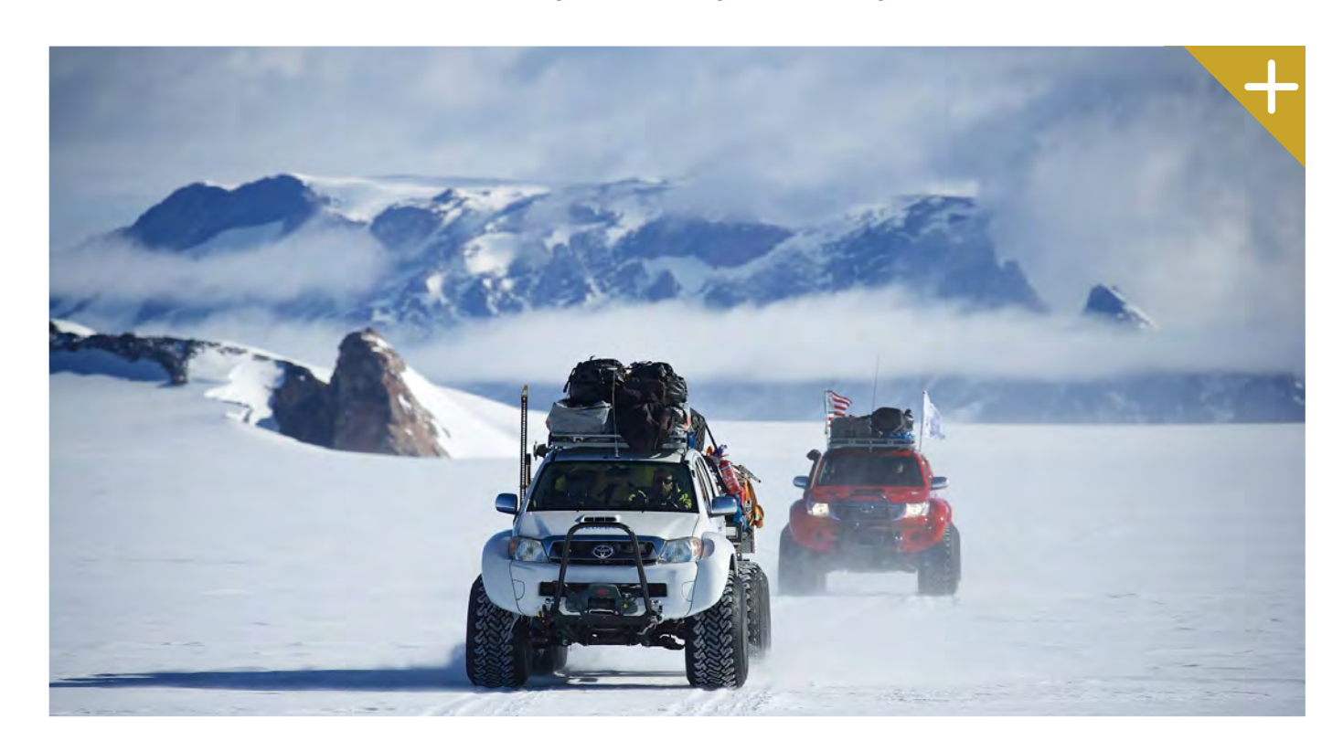
Thursday 22 - Sunday 25 February*

Guests opting for the Arctic Trucking experience will depart for Reykjavik. Alternatively, guests concluding their experience can relax until departure.