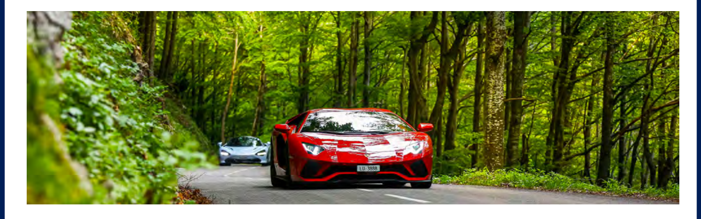
Enquire for pricing

Choose to extend your journey with additional drive days exploring the region and/or overnight stays in stunning boutique hotels located along the route.