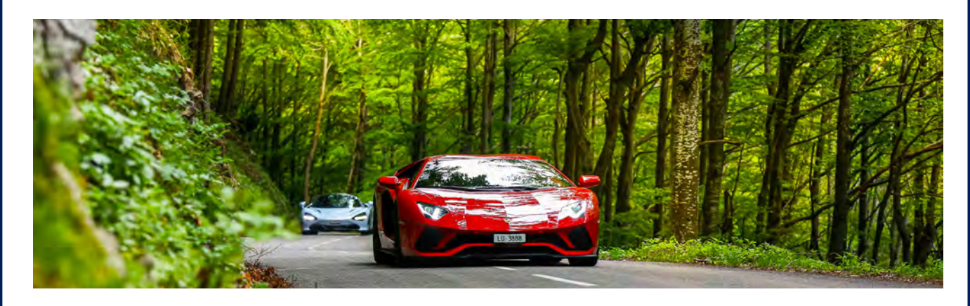
Enquire for pricing

Choose to extend your journey with additional drive days exploring the region and/or overnight stays in stunning boutique hotels located along the route.