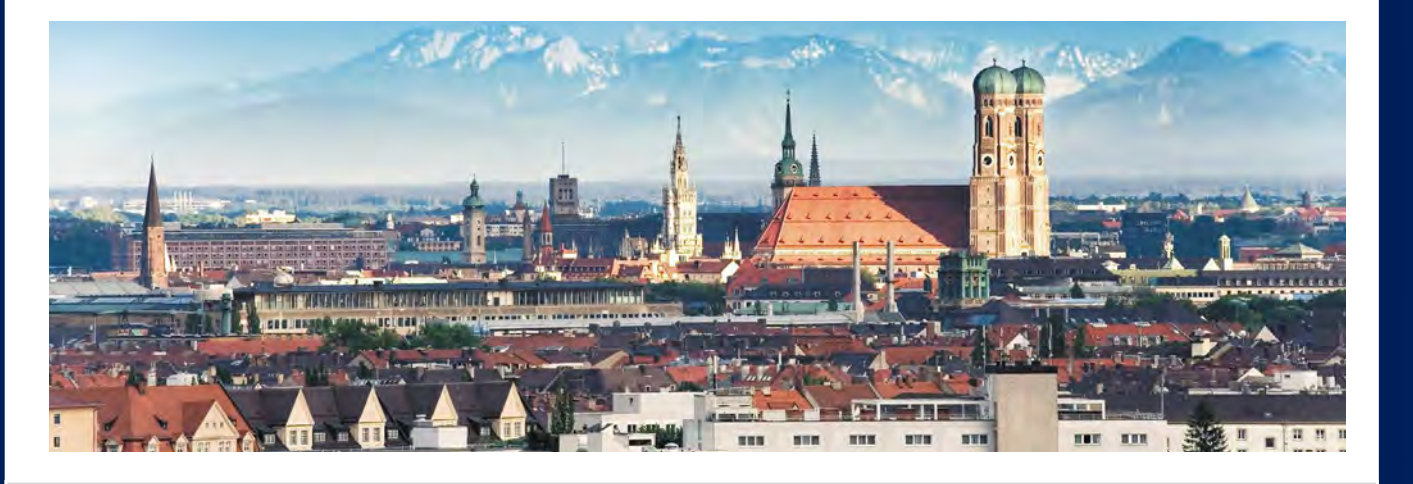
Enquire for pricing