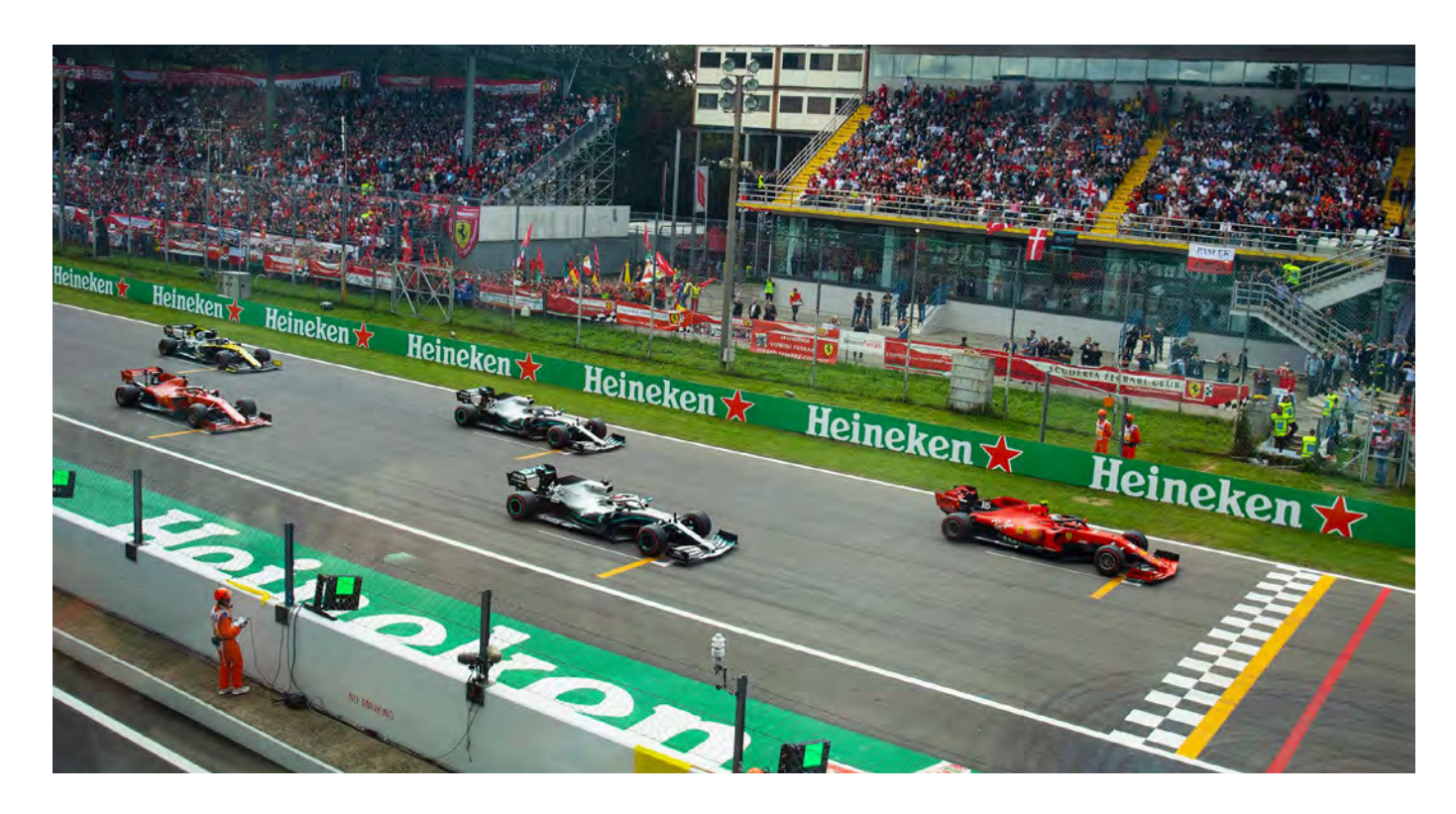
Friday 5 September - Monday 8 September 2025

or those wishing to experience one of the most legendary races in the F1 calendar, you can choose to join us for the Italian Grand Prix weekend - the perfect way to begin an unforgettable experience of Italia.